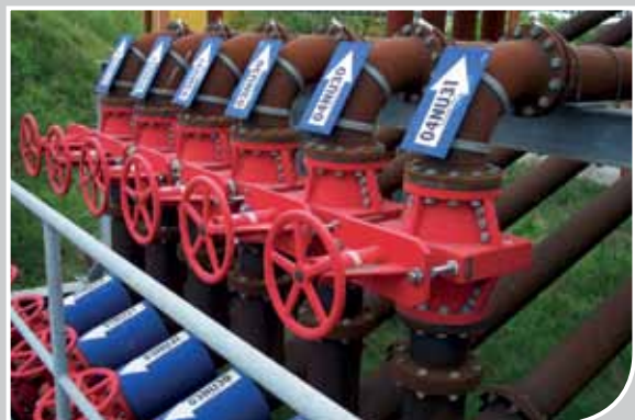
Flowrox pinch valves at DONG Energy

DONG Energy, one of the largest coal power plants in Denmark, has gained valuable benefits with Flowrox valves in their boiler ash/slag slurry installation. In the application, boiler ash/slag is grinded, mixed with sea water and then pumped into settling ponds. In 1996, a total of 31 Flowrox pinch valves were installed in the application. This abrasive and aggressive slurry sets high requirements for on/off slurry valves, and Flowrox pinch valves have more than fulfilled them. Benefits for the customer include excellent wear resistance, reliable operation and extended sleeve lifetime.