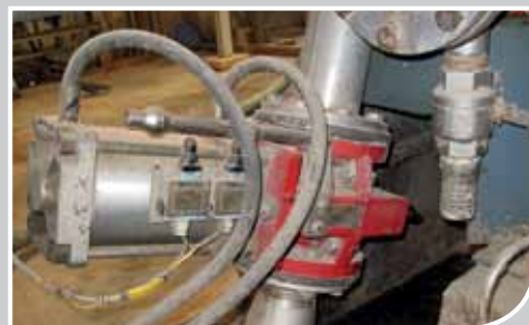
Flowrox pinch valves at GIIC

Flowrox pinch valves were chosen in 2008 when Gulf Industrial Investment Company (GIIC) was commissioning their second iron ore pelletising plant in the Kingdom of Bahrain. Flowrox pneumatically actuated PVE 100 – 150 mm valves are operating in pellet coating and iron ore slurry lines as well as in various side applications. The GIIC plant provides the highest quality pellets to markets all over the world. The best flow control solution was built in cooperation